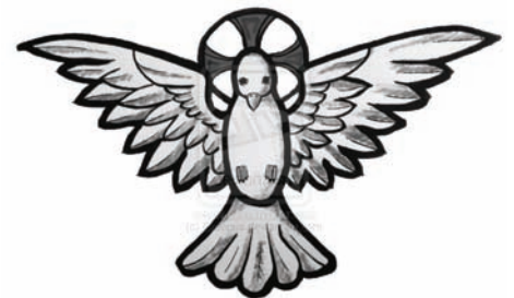
The Holy Spirit

The parish office is receiving notes from new parishioners asking for boxes of offertory envelopes. We do not mail out boxes. The parish office is open on Sundays after the masses, and one can be obtained by requesting a box at that time. A box will be issued to you.